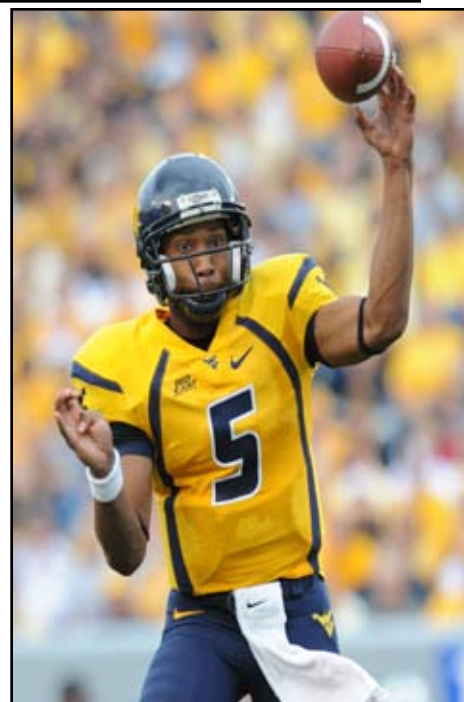
Gaining 1,000-yards rushing and 1,000-yards passing in a season in NCAA History